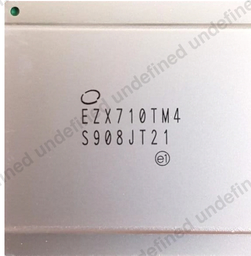
Figure 1-1. Example Component with Identifying Marks